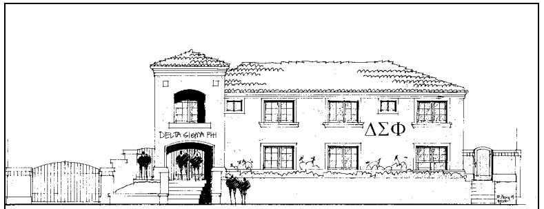
ACB is considering a major remodel of 244 California

What you won't see are all the little upgrades, like the