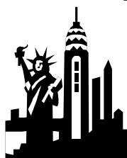
Freedom of speech can be had at the ep-alumni-bss web-

Many brothers use the alumni group to keep up to date and receive these emails at home or work. Off color humor and jokes may not be appreciated by all members of the group.