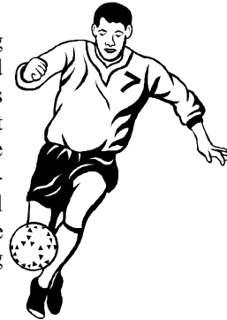
Defending Champs in Soccer and getting better at Basketball.

tive again. Our strongest sport, Soccer is starting to practice for their spring season of IFC and Greek Week. We have a championship to defend in Greek Week so everyone is excited about that challenge. The Soccer team will also be competing in a Greek tournament held at UCSB in the Spring that will match up fraternities from UCSB, USC, Cal Poly and UC-Berkeley.