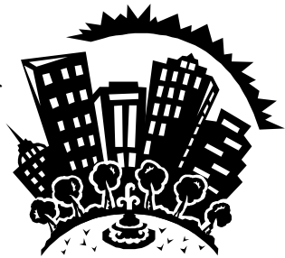
The Chapter is growing

Hey Deuce...try to shorten it up next time us alums have a pretty short attention span...The Editor