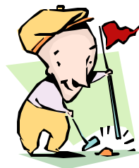
Yeah, like you'd make that putt!

Open House 2003, which will mark the 10 th anniversary of the event, is set for April 25-27. The theme will be "Treasuring Royal Traditions," and activities will include Admitted Students' Preview Day, the Poly Royal Parade, the Cal Poly Rodeo, the Tractor Pull and the Design Village competition.