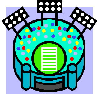
St Mary's Stadium is not really like this

Both the visitor and home grandstands are very close to the field. General admission is $12 and kids get in for $6. In the past, less than 500 people sit on the Cal Poly side of the stadium. We should not have any trouble finding each other.